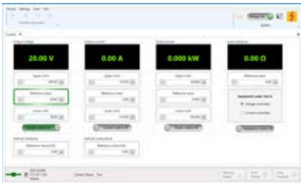
Figure 2: Comprehensive information on the main operating values with setting of the controller mode constant voltage (CV), current (CC), power (CP), or resistance (CR) and additional setting of real-time calculated internal resistance (Ri) or conductance (Gi)

Firmware updates can be carried out quickly and easily for individual units or master-slave systems with a single command. A built-in diagnostic is available when handling support cases concerning the application of the power supplies.