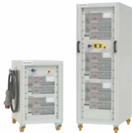
Figure 3: REGATRON's rack-integrated turn-key system solutions for various power levels e.g. 72 kW (left) and 162 kW (right). Various options allow for comfortable handling.