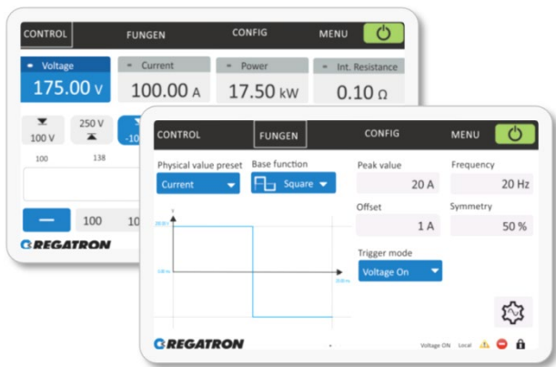
Figure 3: Intuitive control by HMI touch display. Everything you need at a glance.

With the remote control unit (RCU) it is possible to control the device or system from a distant location in the same manner as with the HMI.