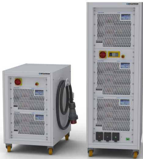
Figure 4: REGATRON's rack-integrated turn-key system solutions, e.g., 72 kW (left) and 162 kW (right) power levels. Various types of AC/DC connectors and cables allow for comfortable handling. Third-party product integration and numerous safety options are additional features.