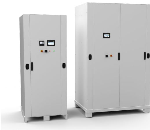
Figure 5: REGATRON's liquid-cooled system solutions up to IP54 with various power levels e.g. 54...162 kW (left) and 216...324 kW (right). The remote control unit RCU, indicator lights, emergency stop button, and main switch allow the user to operate the system on the enclosure's front door.